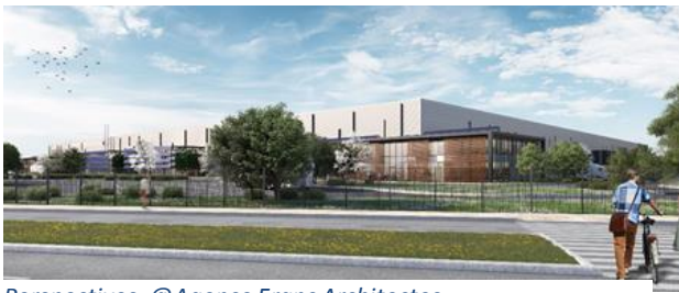
Perspectives